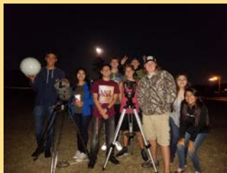
Above is the Astronomy class observing this week's "Supermoon". We used telescopes and a moon globe to identify features on the moon's surface.

It was a great time that these students will always remember!